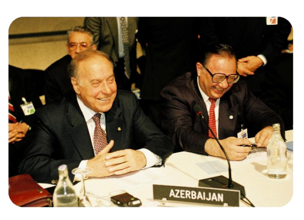
Source: Heydar Aliyev's Heritage Research Center (middle photo on right column) Source: © NATO (all the rest photos on this page)